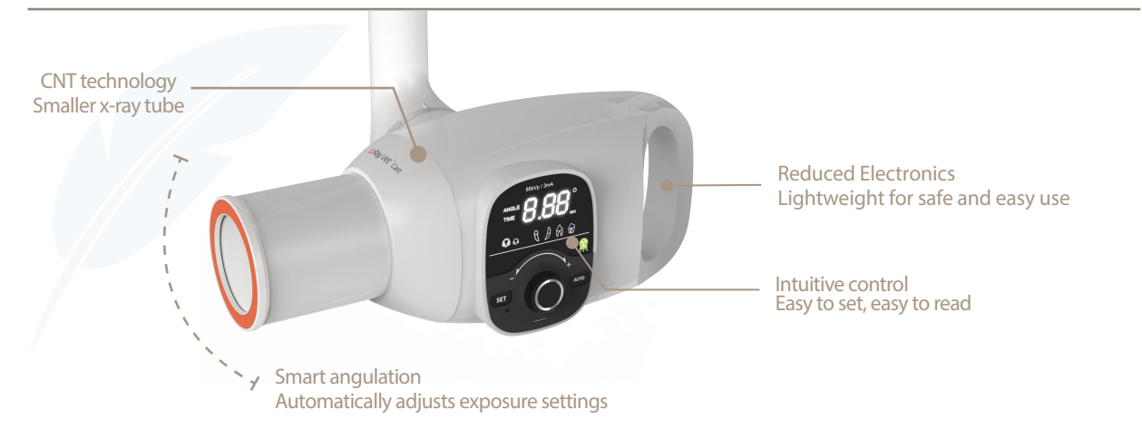
The 5.6 lbs lightweight tube head makes it easy to handle and position, producing a faster workflow.